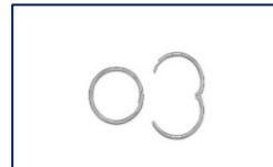
Silver or Gold plain sleepers

There are five options in earring style permitted, one worn in the lobe of each ear.