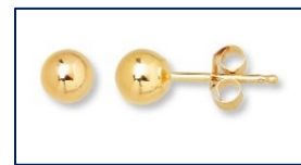
Plain Gold Studs no bigger than 6mm