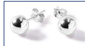
Plain Silver Studs no bigger than 6mm