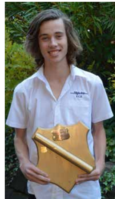
HOUSE SPIRIT CHISHOLM

Please note new date for P&FA AGM - Tuesday 6 June