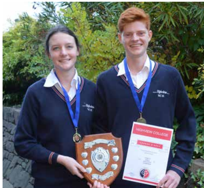
HOUSE CHAMPIONS CAMPBELL