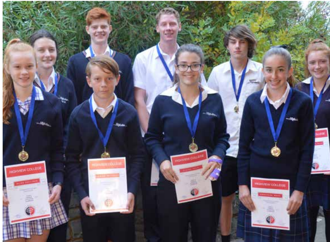
2017 YEAR LEVEL CHAMPIONS