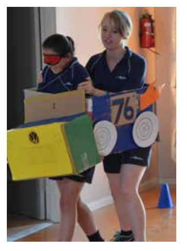
Education Through Wholeness