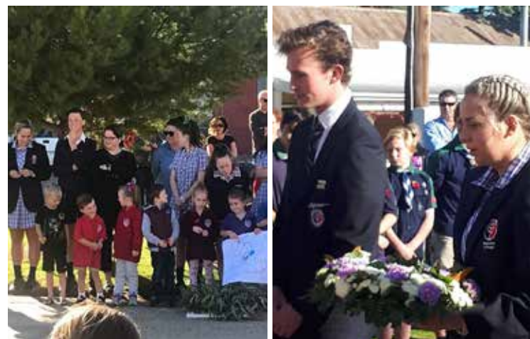
Pictured above and to the left are Highview students attending the Maryborough and Avoca Anzac Day services.