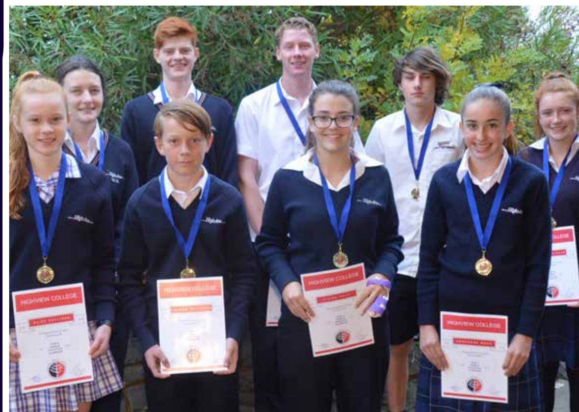
2017 YEAR LEVEL CHAMPIONS