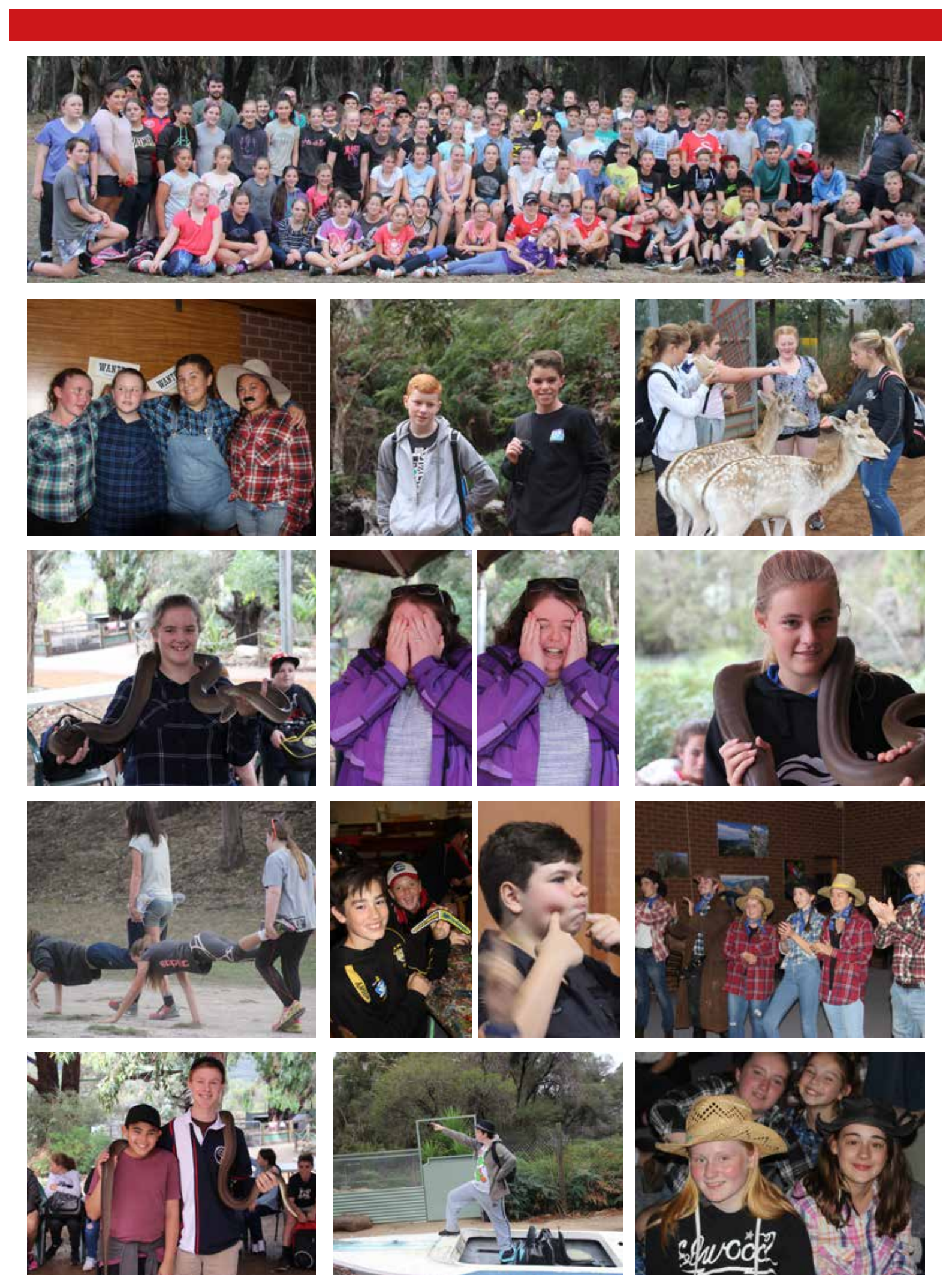
Education Through Wholeness