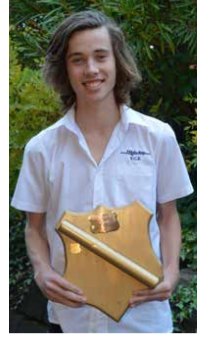
HOUSE SPIRIT CHISHOLM